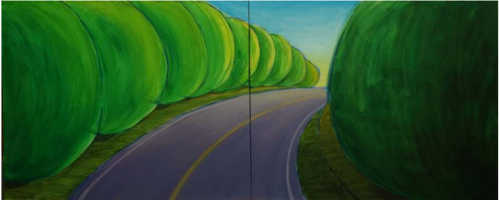
Anese Eun Cho Path IX 24 x 30 & 24 x 30 = 24 x 60 Oil on Canvas 2011