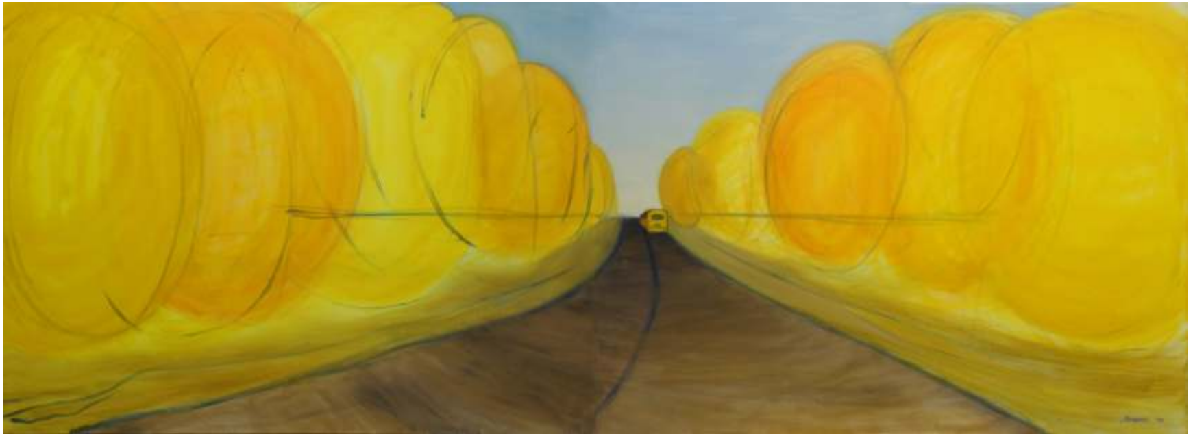
Anese Eun Cho Path I 30 x 40 & 30 x 40 = 30 x 80 Oil on Canvas 2013