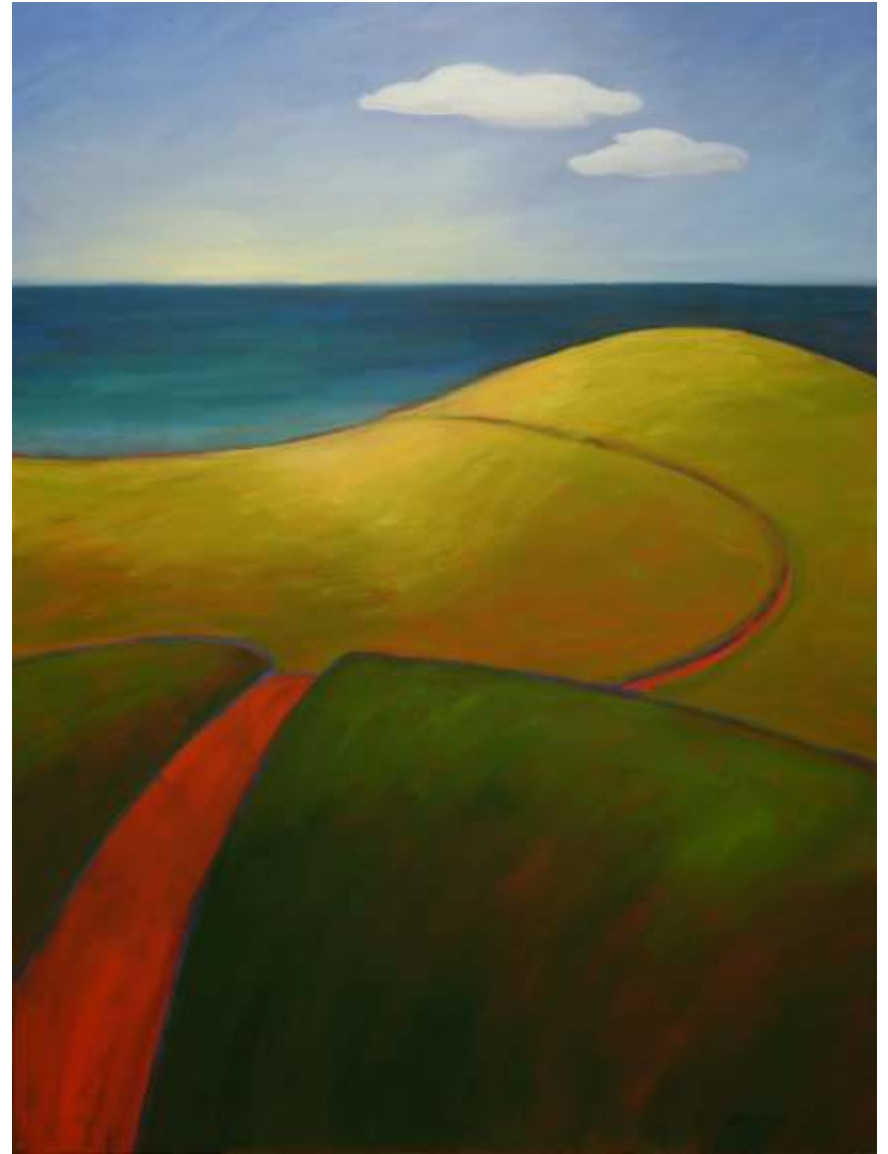
Path V 48 x 36 Oil on Canvas 2014