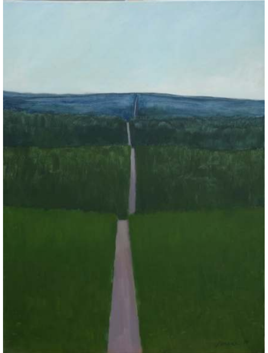
Anese Eun Cho Path XIII 30 x 22 Oil on Canvas 2014