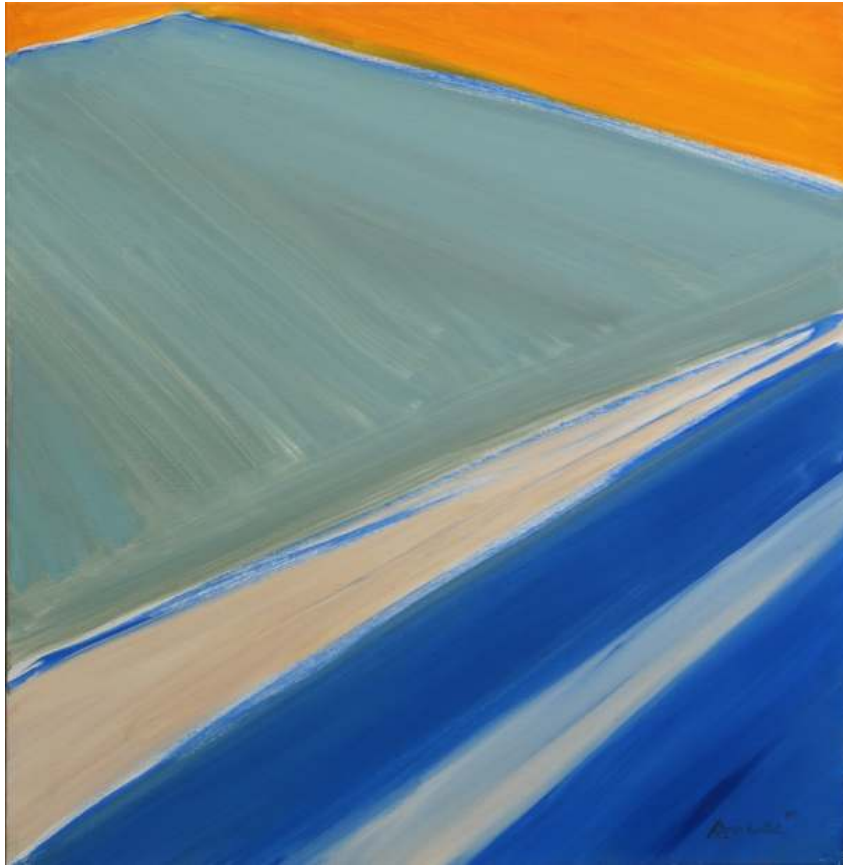
Anese Eun Cho Path XXI 24 x 24 Oil on Canvas 2014