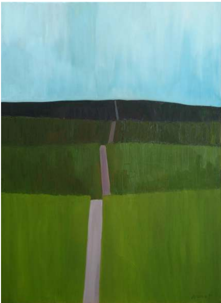
Path XIV 30 x 22 Oil on Canvas 2014