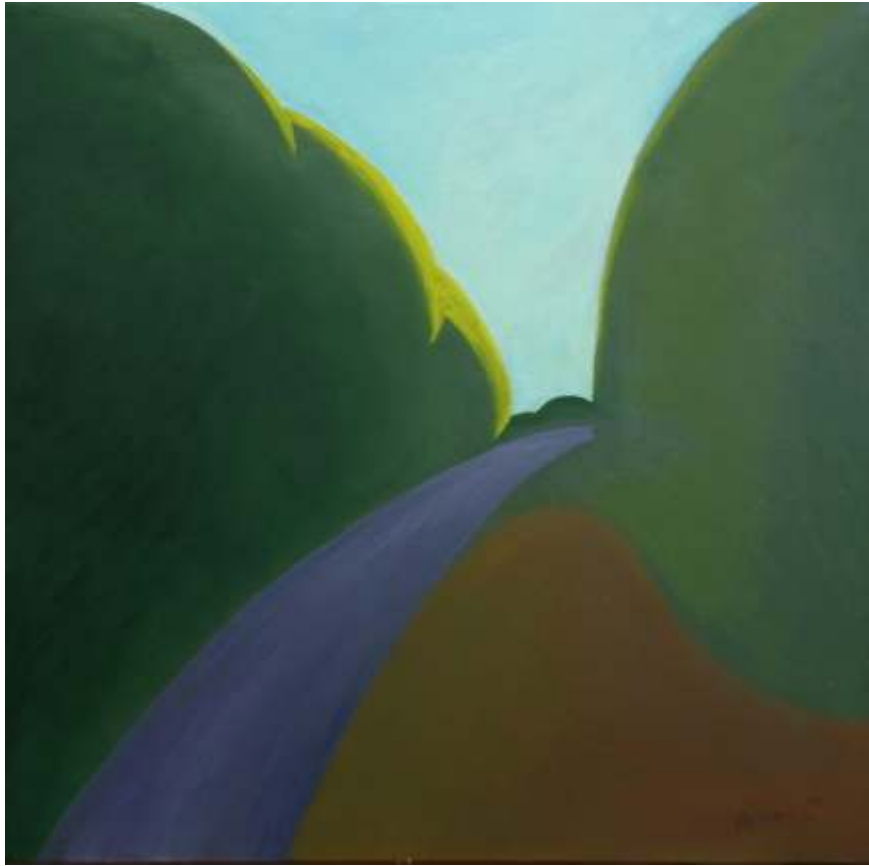
Anese Eun Cho Path XVIII 24 x 24 Oil on Canvas 2014