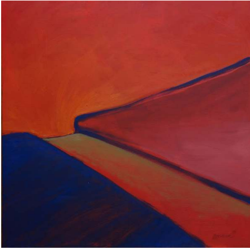
Anese Eun Cho Path XXIV 24 x 24 Oil on Canvas 2014