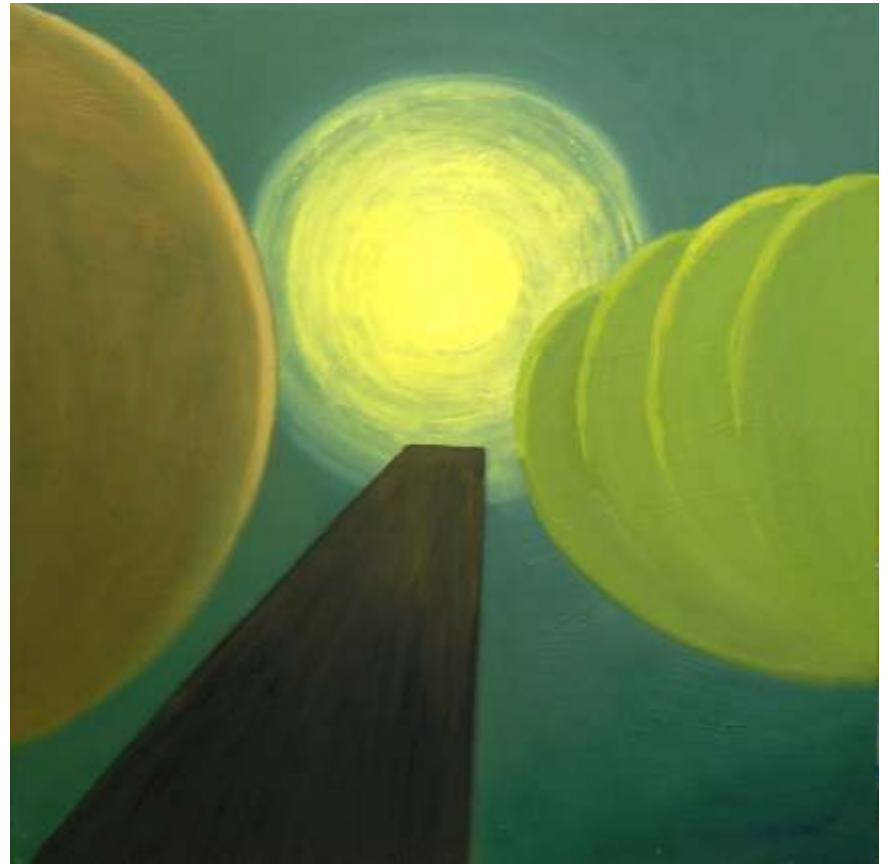
Anese Eun Cho Path XVII 24 x 24 Oil on Canvas 2014