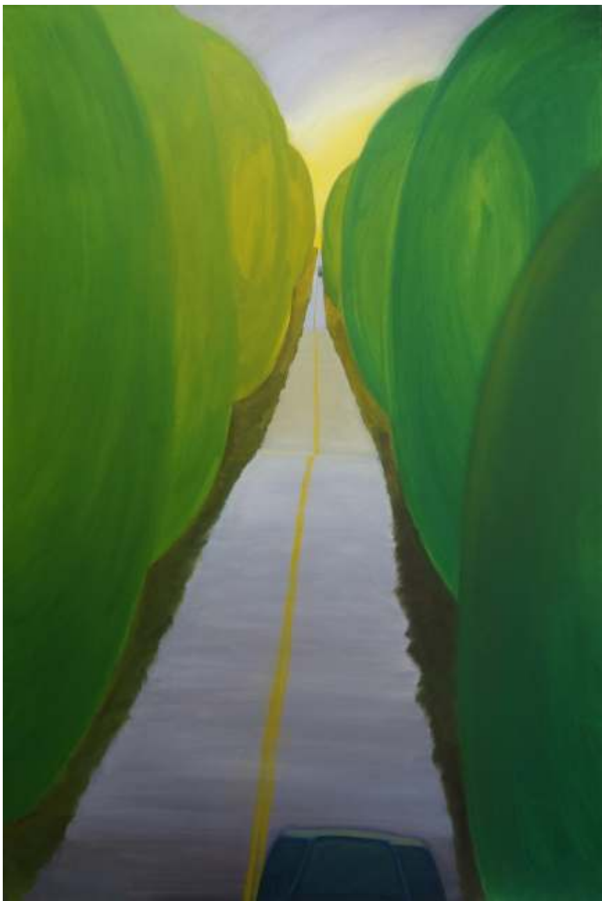
Path VII 72 x 48 Oil on Canvas 2012