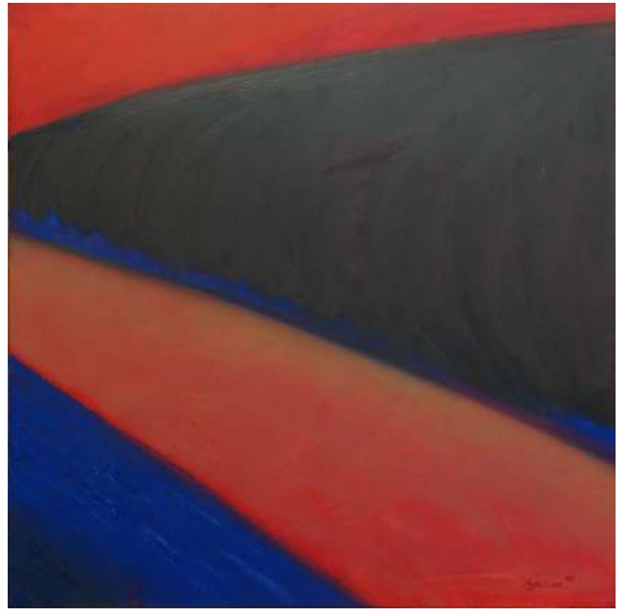
Anese Eun Cho Path XXV 24 x 24 Oil on Canvas 2014