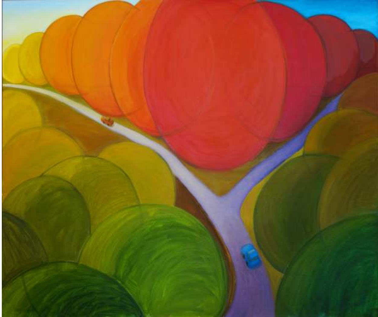
Anese Eun Cho Path III 60 x 72 Oil on Canvas 2013