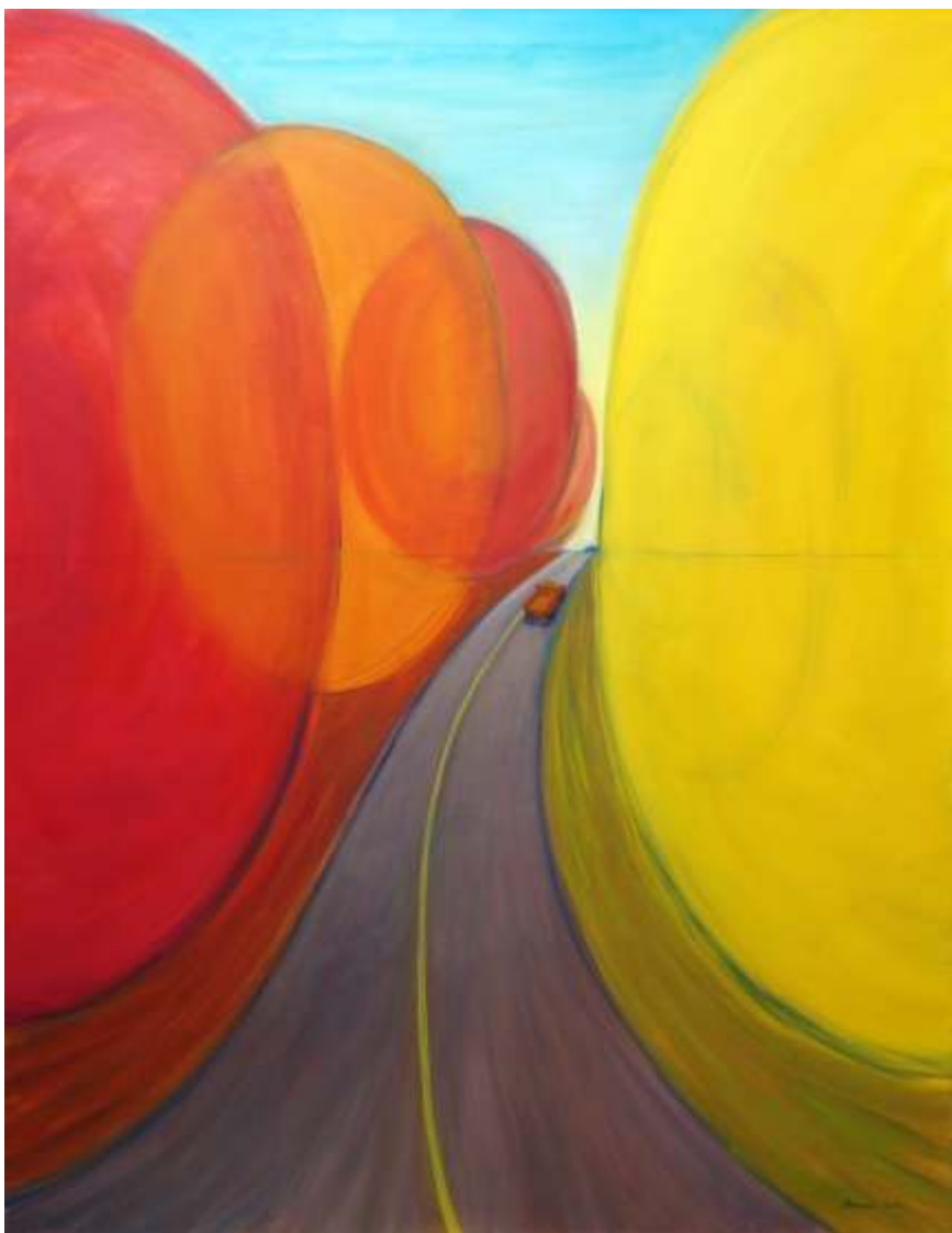
Path IV 48 x 36 Oil on Canvas 2012