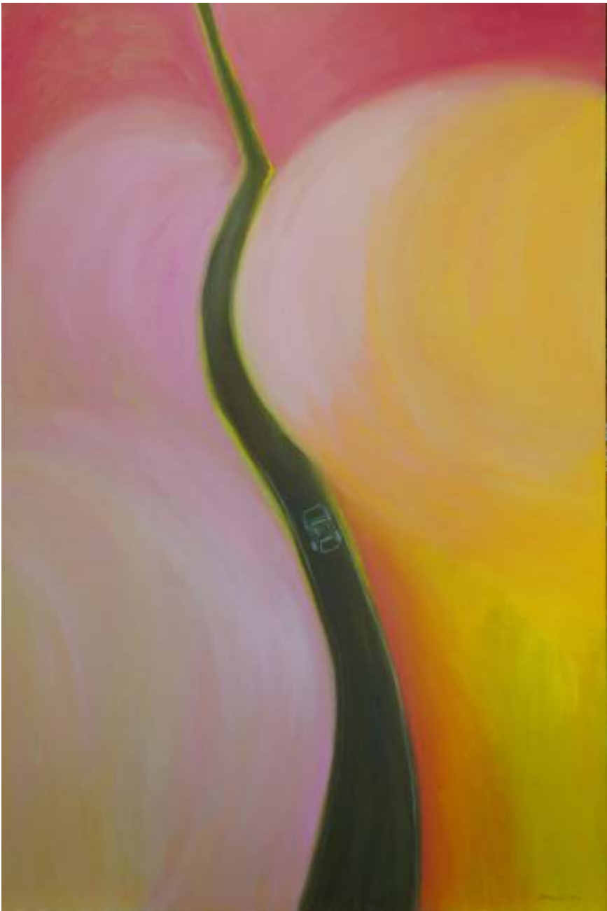
Path X 72 x 48 Oil on Canvas 2012