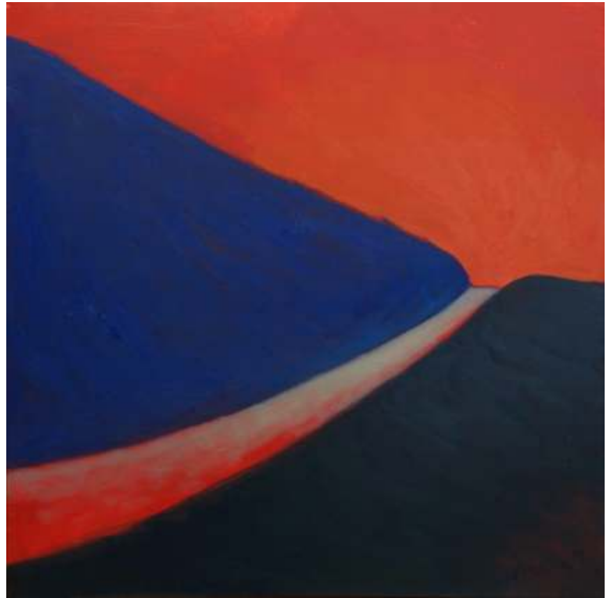
Anese Eun Cho Path XXIII 24 x 24 Oil on Canvas 2014