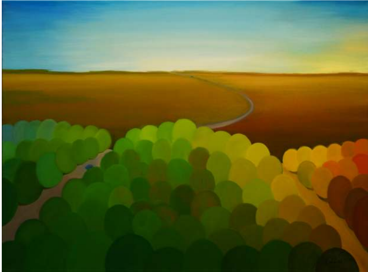
Anese Eun Cho Path XI 30 x 40 Oil on Canvas 2015