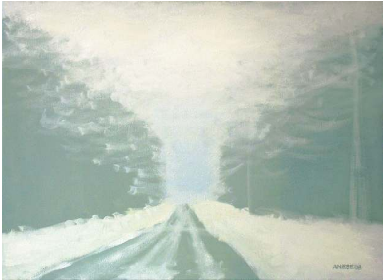
Anese Eun Cho Path XV 22 x 30 Oil & Acrylic on Canvas 2008