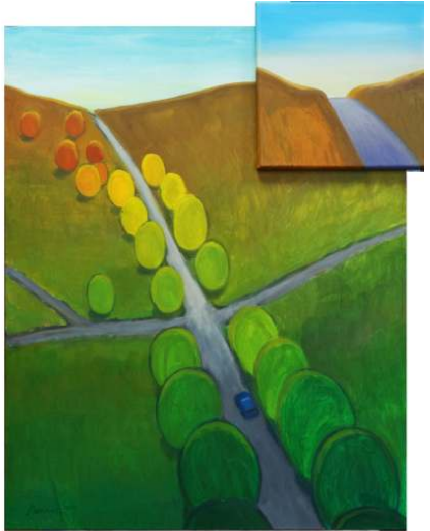
Path XII 30 x 24 & 1 x 10 Oil on Canvas 2014