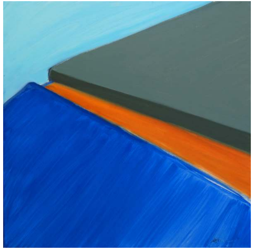
Anese Eun Cho Path XXII 24 x 24 Oil on Canvas 2014