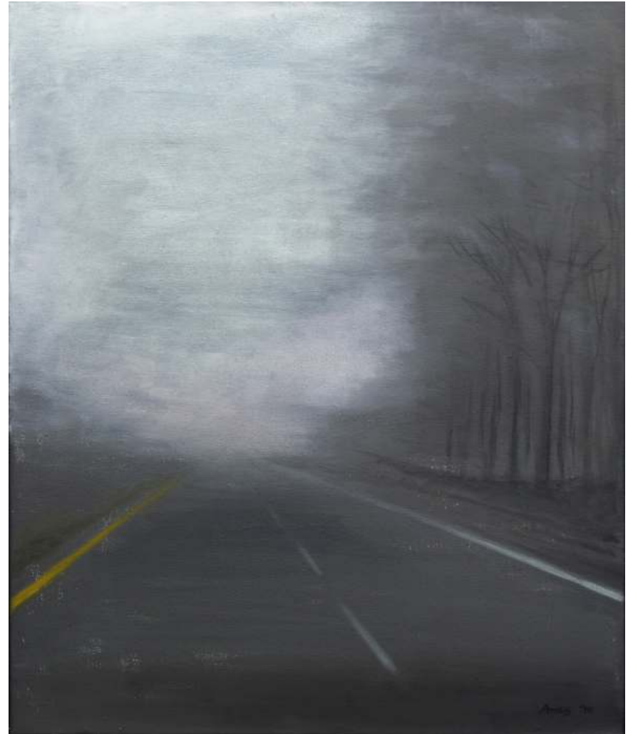
Path VI 24 x 20 Oil on Canvas 2010