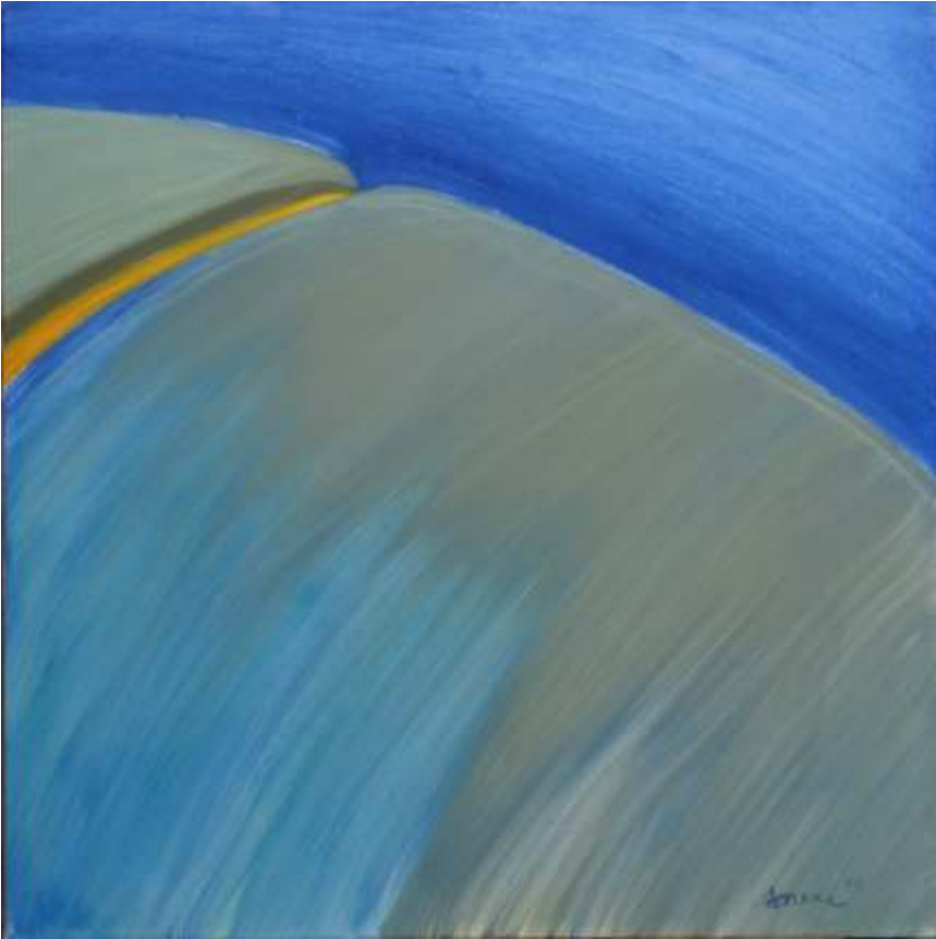
Anese Eun Cho Path XX 24 x 24 Oil on Canvas 2014