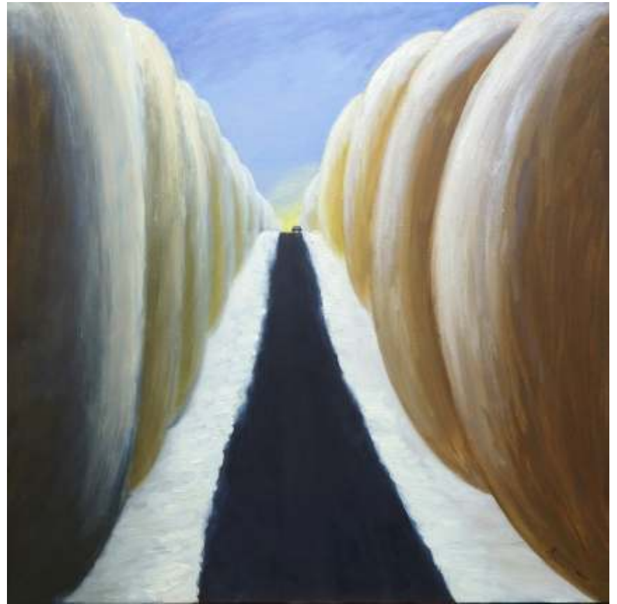
Path XVI 36 x 36 Oil on Canvas 2014