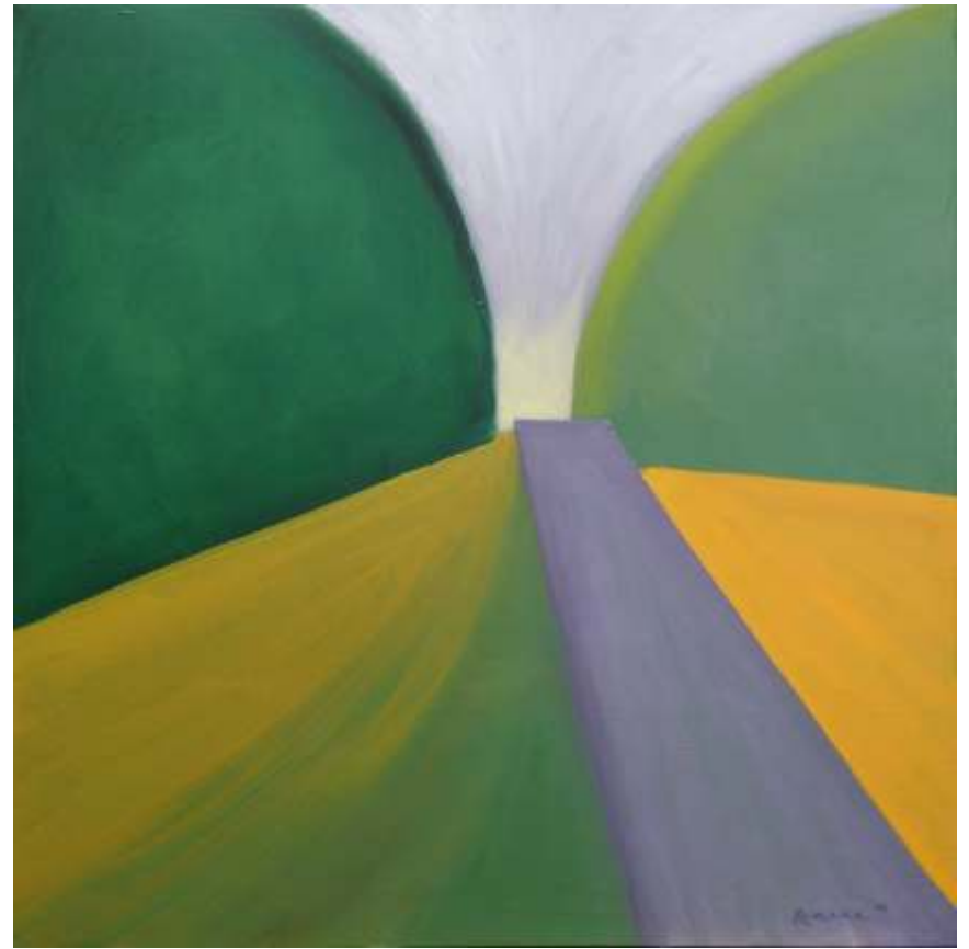
Anese Eun Cho Path XIX 24 x 24 Oil on Canvas 2014