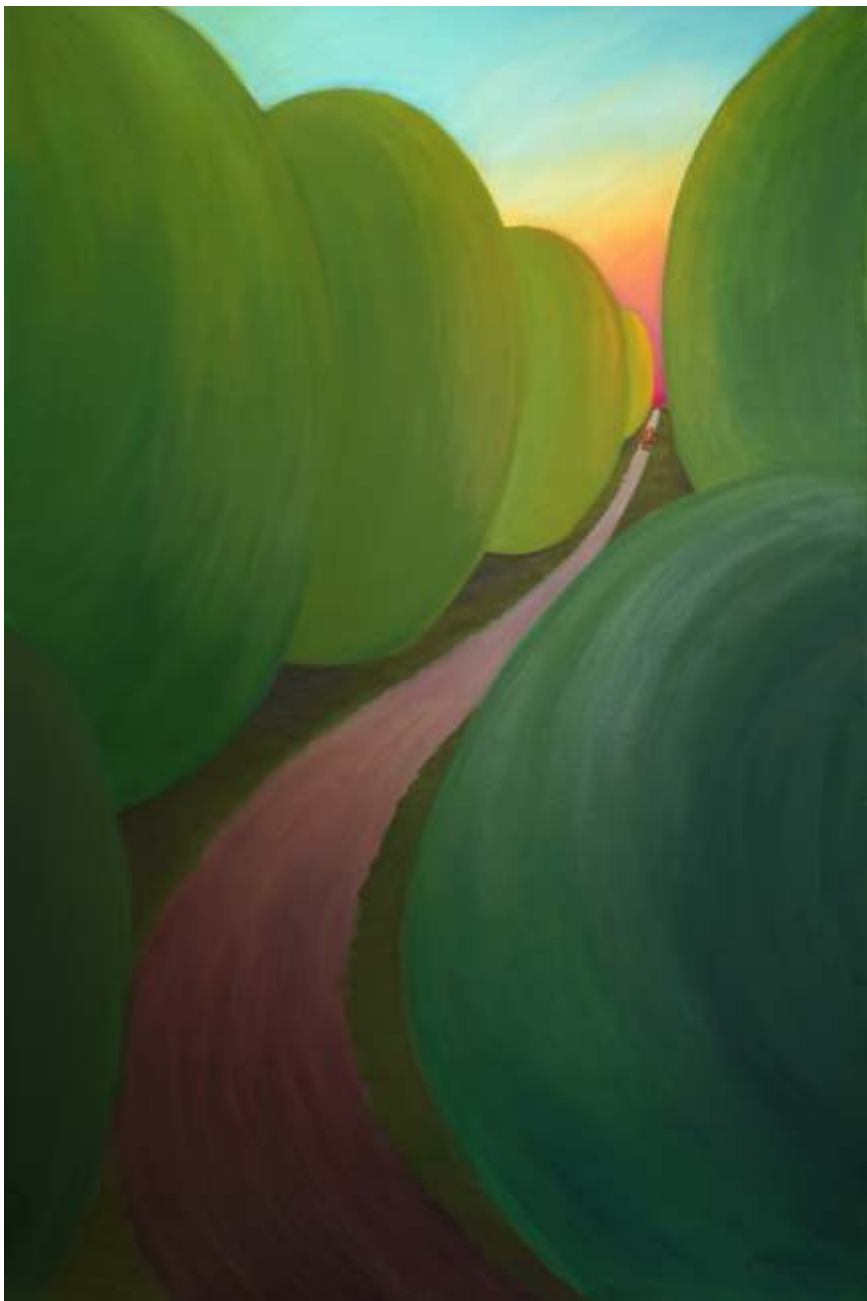
Path VIII 72 x 48 Oil on Canvas 2012