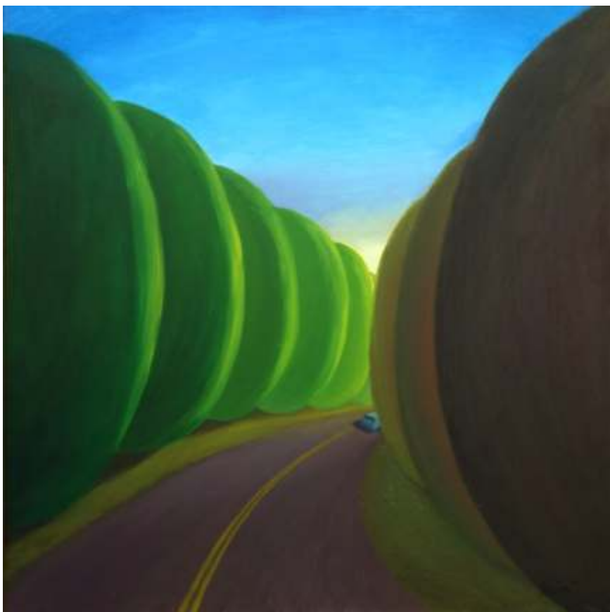
Path II 36 x 36 Oil on Canvas 2014